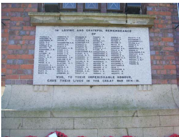
War Memorial Clock tower, Coalville